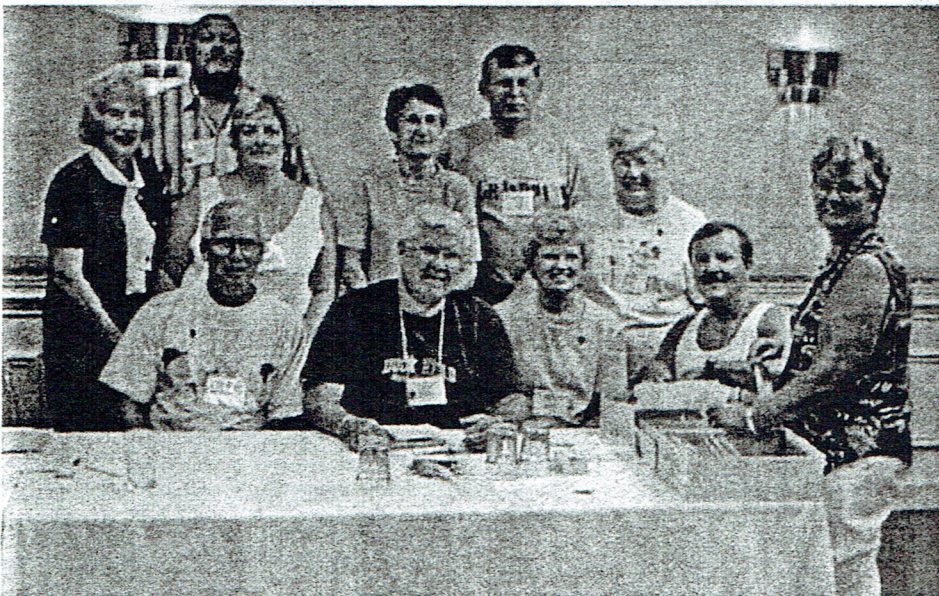
Board Members. Hard at work!